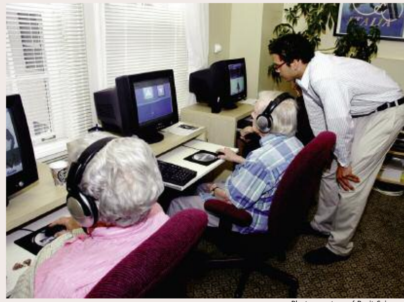
Figure 1. The Brain Fitness Program is a series of computerbased exercises designed to improve important brain functions.