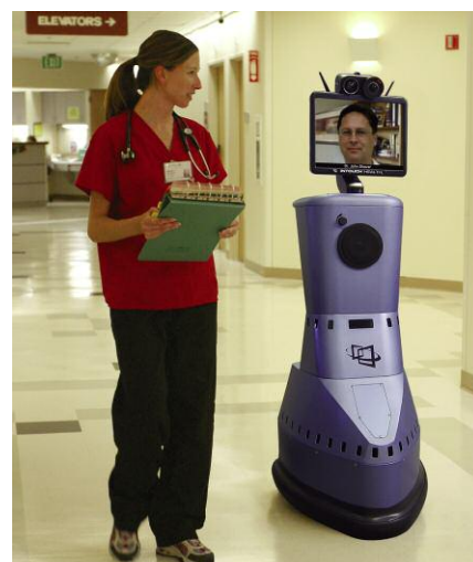
Figure 1. Pearl, an RP-7 robot, walks the halls of Longwood Retirement Community with a physician consult.

All of these applications have successfully demonstrated various but limited aspects of assistive robots in therapeutic settings. Each