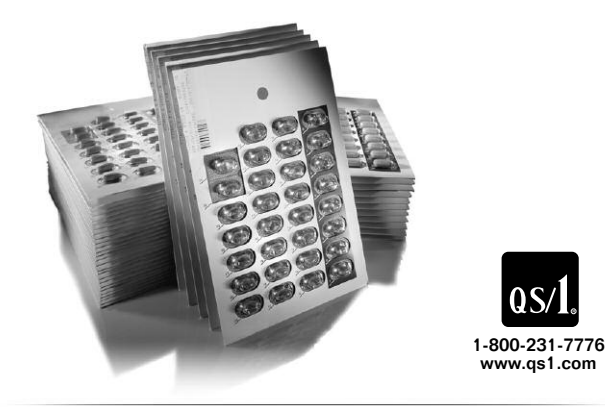
@ 2005, J M SMITH CORPORATION. QS/1 and PrimeCare are registered trademarks of the J M Smith Corporation.

If you need a high-volume pharmacy management system with built-in tools for improving efficiency, you need PrimeCare<sup>®</sup>. Call QS/1 today at 1-800-231-7776 .